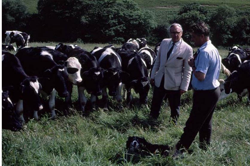
Dairy cattle grazing, Devon, UK