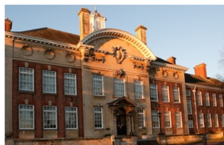
University of Northampton