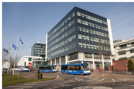
University of Derby