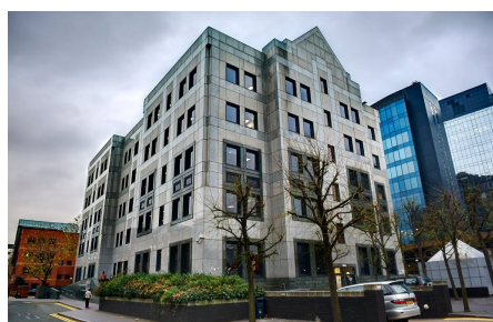
University of Sunderland